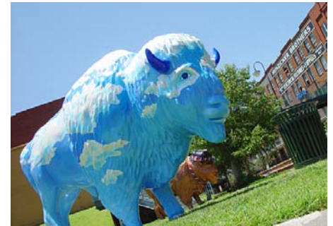
'Lil Joe,' ACOG's Clean Air buffalo, will re-emerge this summer in and around Bricktown.

Since the implementation of Metro-Transit's free bus rides on Alert Days, ridership generally goes up when compared to non-Alert Days. Throughout five years of ridership data, there is a general rise in ridership on Alert Days. Ridership increases on Alert Days is a positive ...See "Clean Air" on page four.