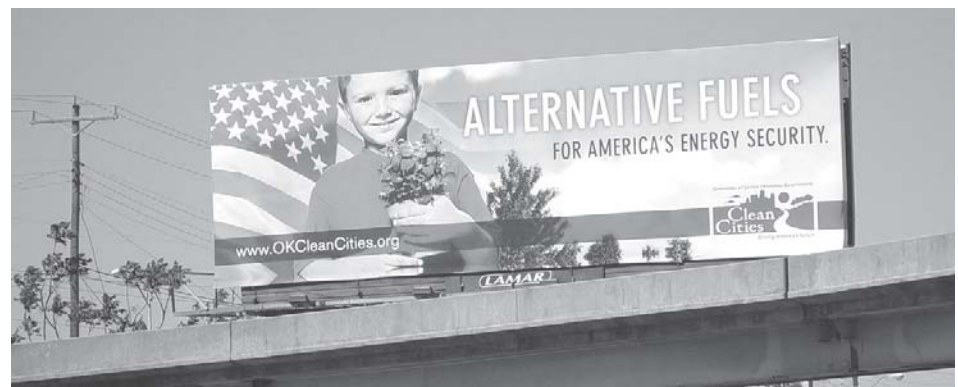
The Central Oklahoma Clean Cities program is actively promoting alternative fuels in the region

Central Oklahoma Perspective, printed by TNT Printing, is authorized by the ACOG Board of Directors. Financing is partly provided by the U.S. Environmental Protection Agency, the Oklahoma Department of Commerce, the U.S. Department of Transportation and local dues. 1,850 copies were prepared and distributed at a cost of $944. Copies have been deposited with the Publications Clearinghouse of the Oklahoma Department of Libraries.