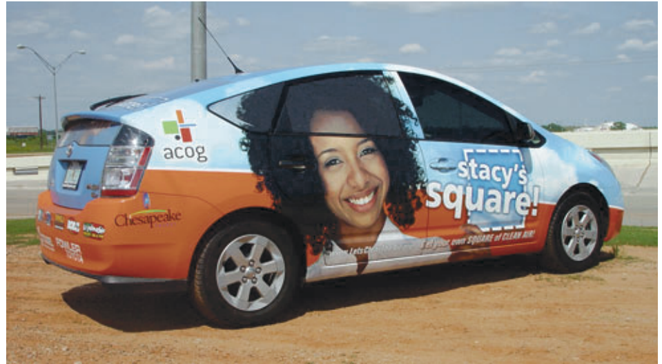
The ACOG Clean Air Committee showcased its new "moving billboard" with a Toyota Prius that is emblazoned with the "Get Your Own Square of Clean Air" theme. This car is among many components of the program.

Air pollution not only affects health, but it impacts economic vitality, future development and quality of life. The economic impact of a "non-attainment"