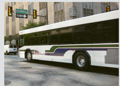
METRO Transit has 15 new buses in its fleet.