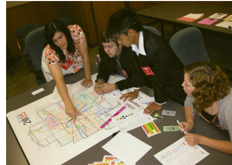
ACOG's new transportation planning game, Red Dirt Monopoly, teaches players about regional transportation planning, budgeting and compromise. It is available for civic groups, workshops and other public audiences.

pieces that are then attached directly to the map. The map is kept and reviewed later for planning and spending trends, ...See "Monopoly" on page three.