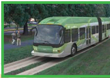
Bus Rapid Transit

To read the complete Fixed Guideway Study, visit: gometro.org or acogok.org .