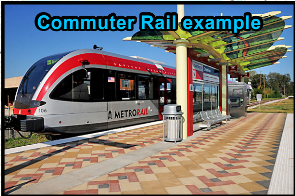
Commuter Rail example