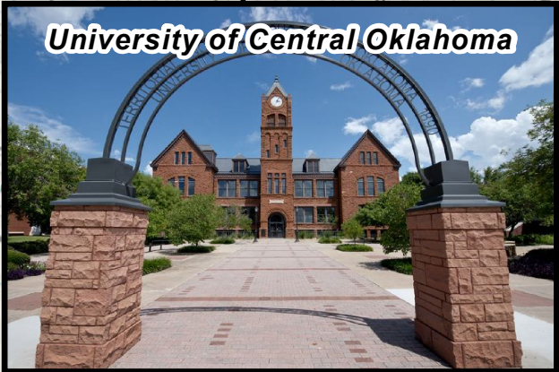
University of Central Oklahoma