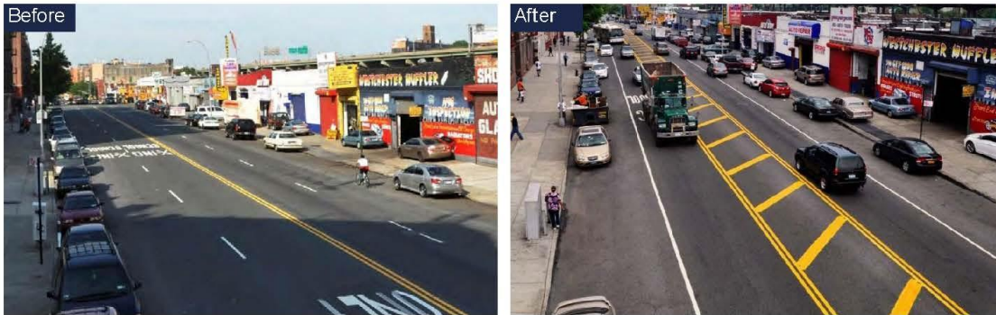
Example of a Road Diet on Southern Blvd., Bronx, New York