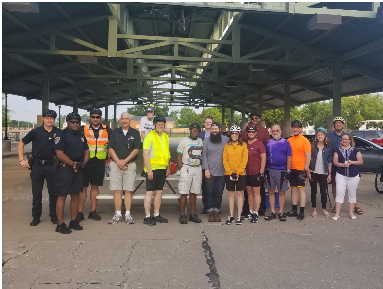
Meeting at Festival Plaza for breakfast before the ride