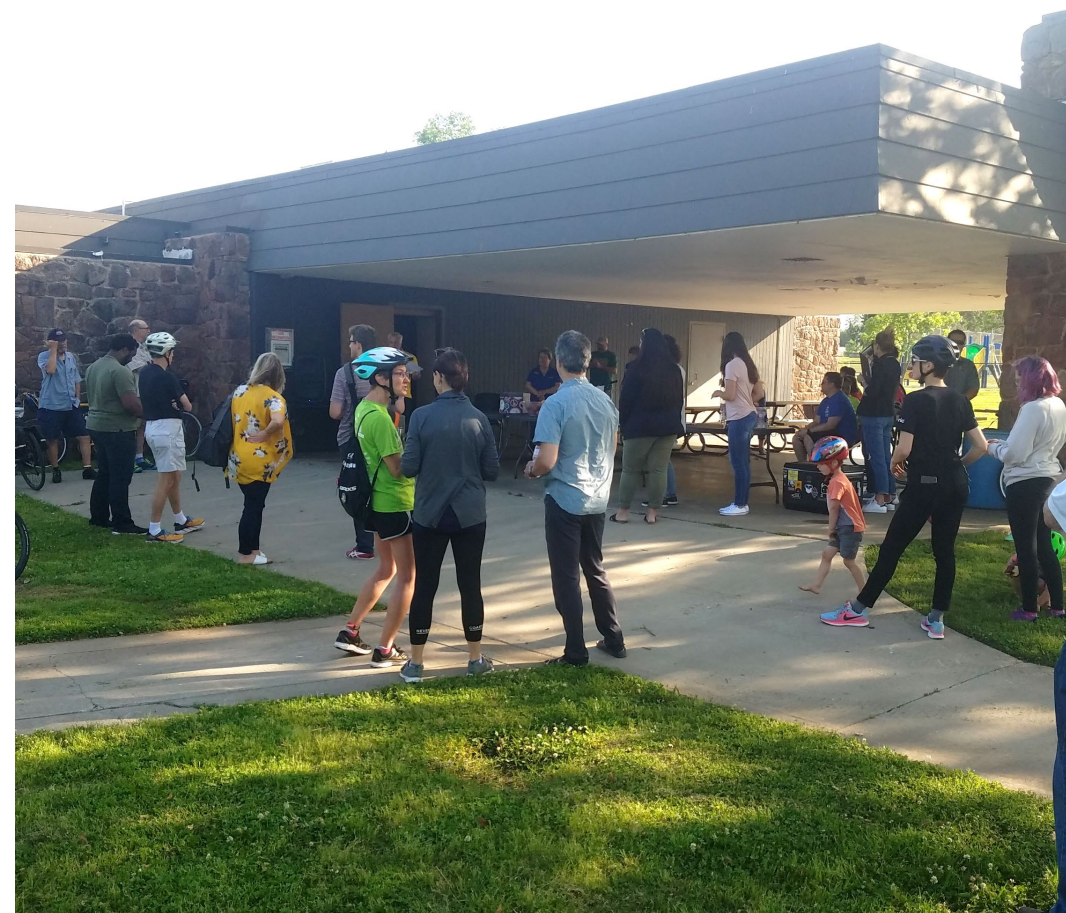
Meeting up for breakfast and coffee after Norman's ride.