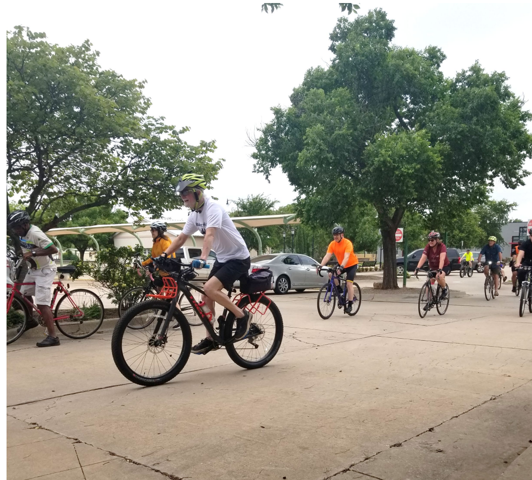
Have a good ride!