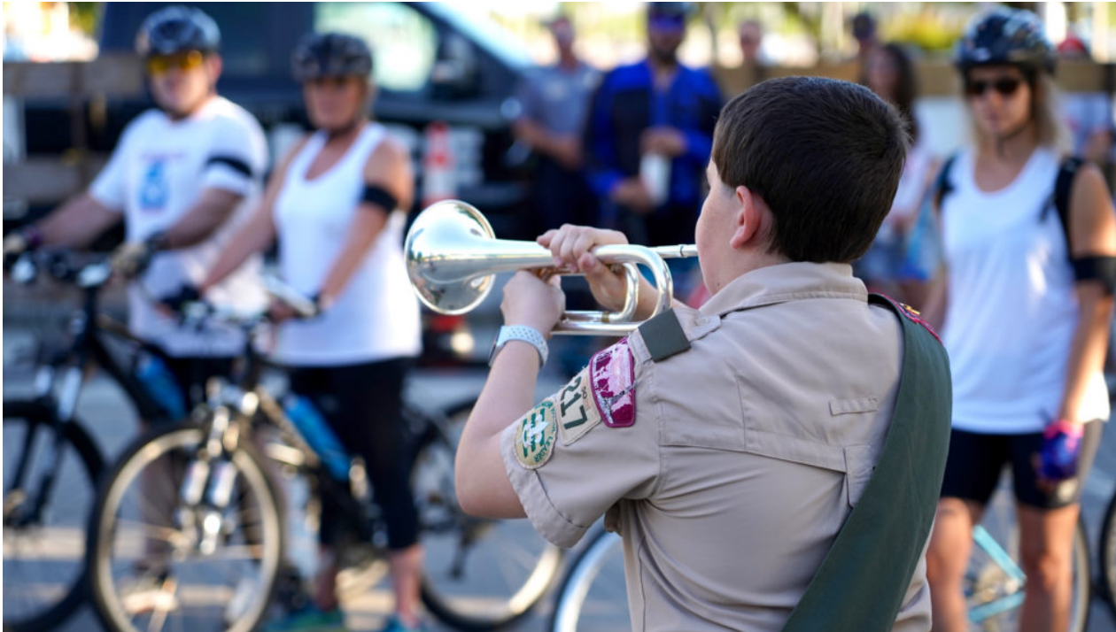
Eagle Scout plays taps with a bugle as riders pause before the Ride of Silence in OKC.

Cyclists came together in OKC for the Ride of Silence. This is a national ride that honors those who have lost their lives or have been injured while cycling.