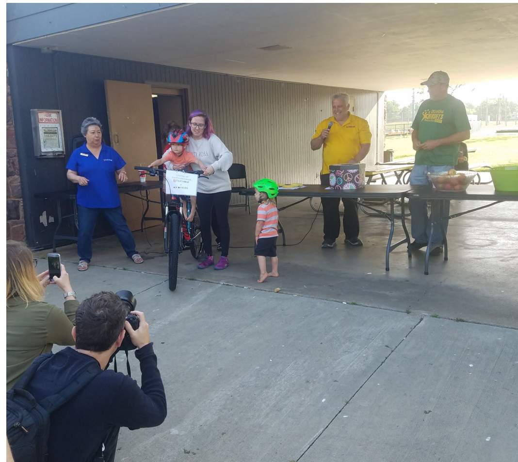
First United and Al's Bicycle giving away a free bicycle.