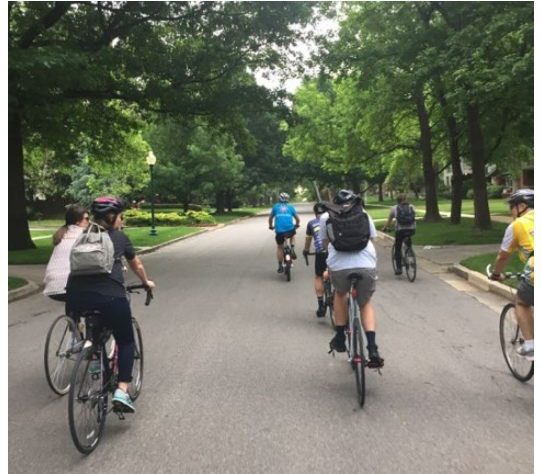
Ride through Heritage Hills in OKC