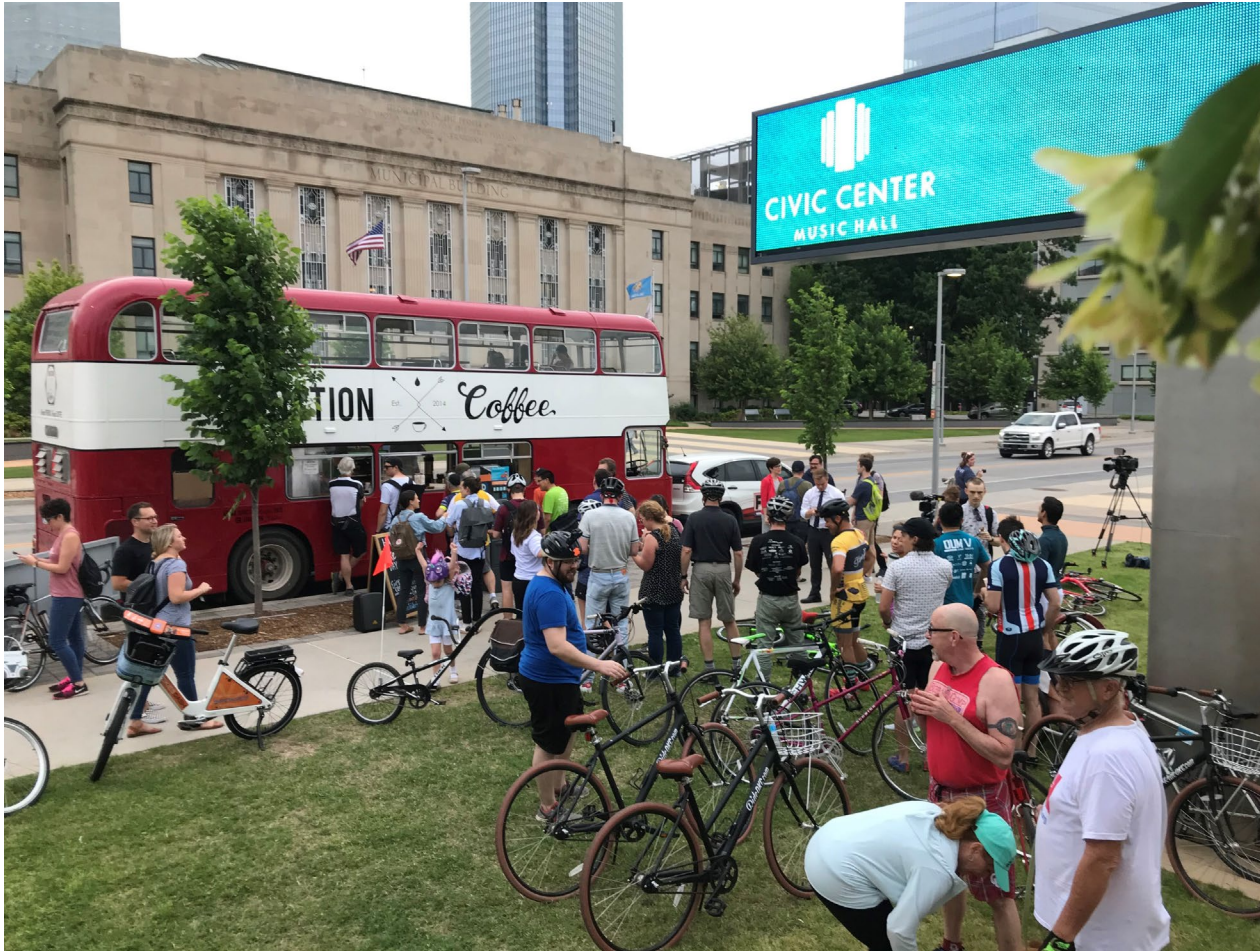
An estimated 100 people meet at Bicentennial Park and enjoy free coffee, courtesy of Downtown OKC.