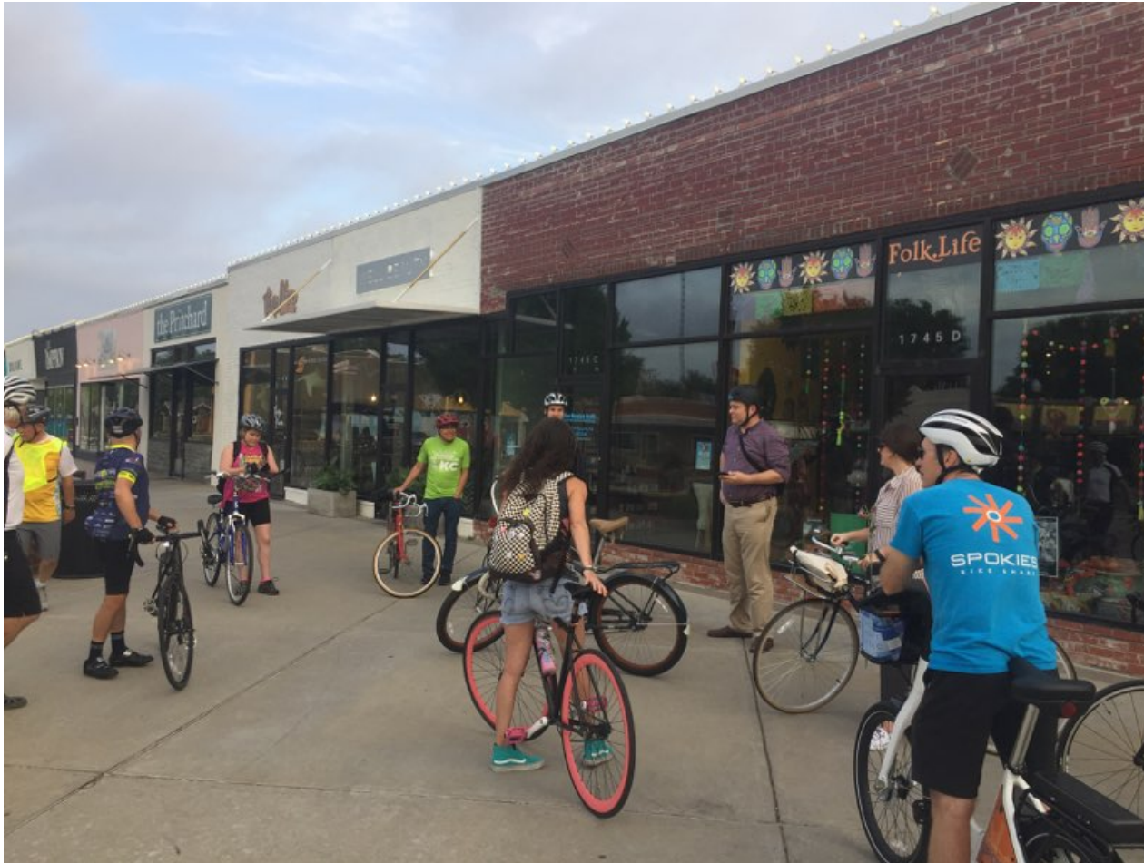
Group starting at the Plaza District