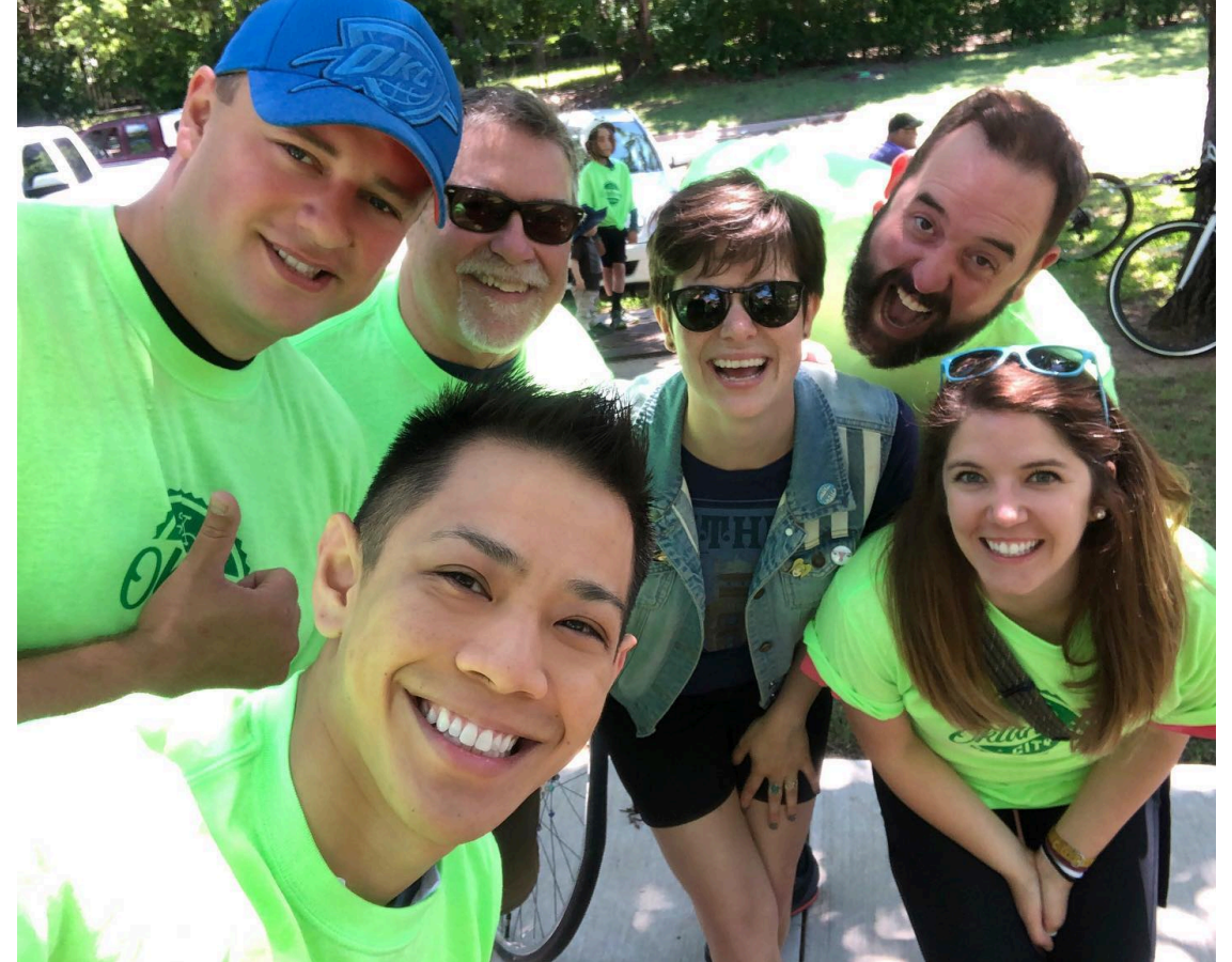
Councilmember JoBeth Hamon supporting safer streets with OKC bike riders.