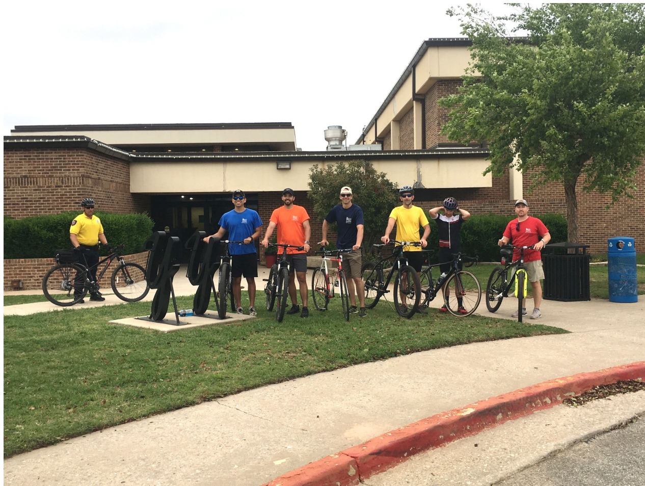
The group met at Yukon City Hall and rode to the Yukon Community Center.