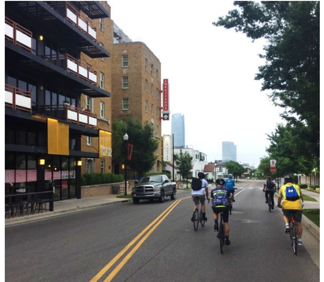
OKC group ride through Midtown.