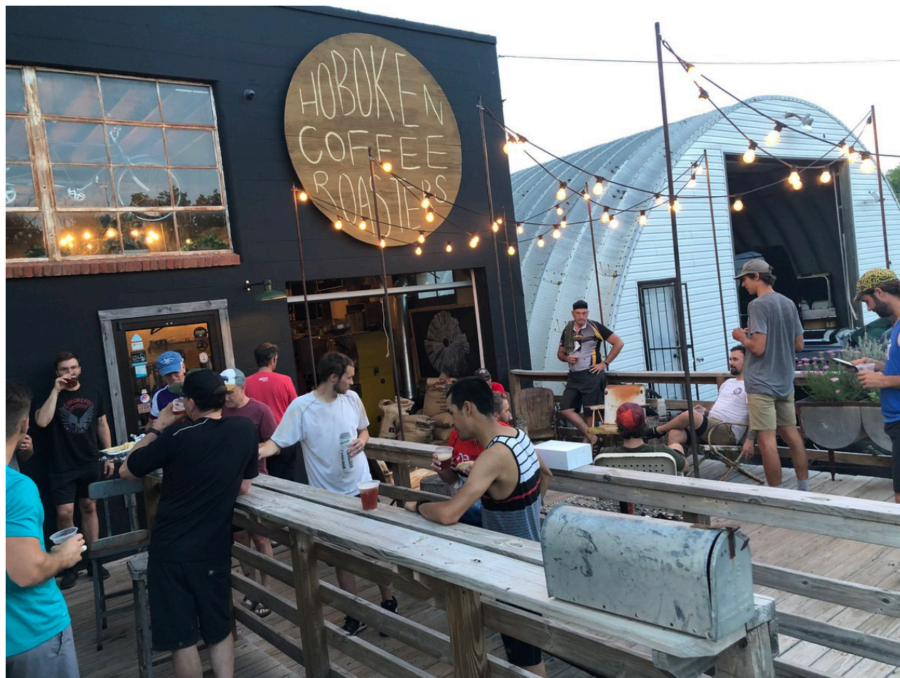
Group enjoying a coffee at Hoboken Coffee Roasters after the ride.