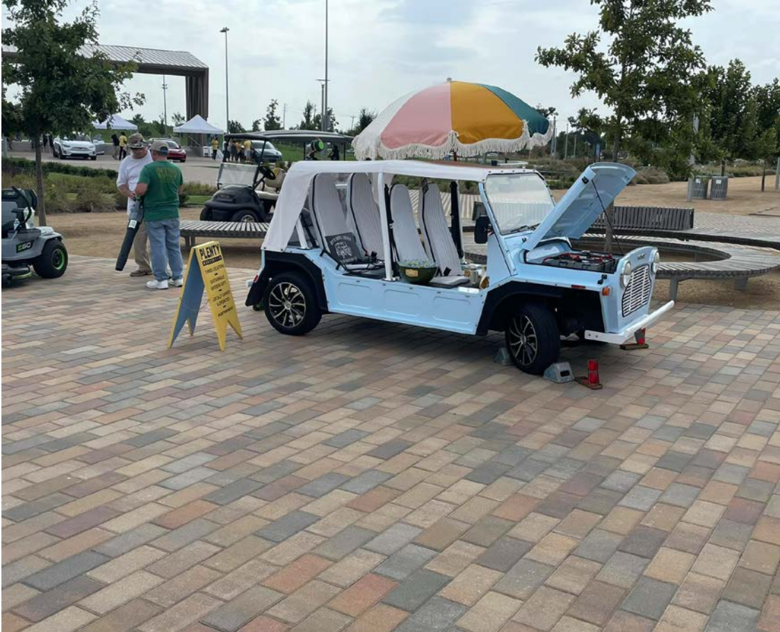
Plenty Mercantile showcased The Moke - a low-speed electric vehicle