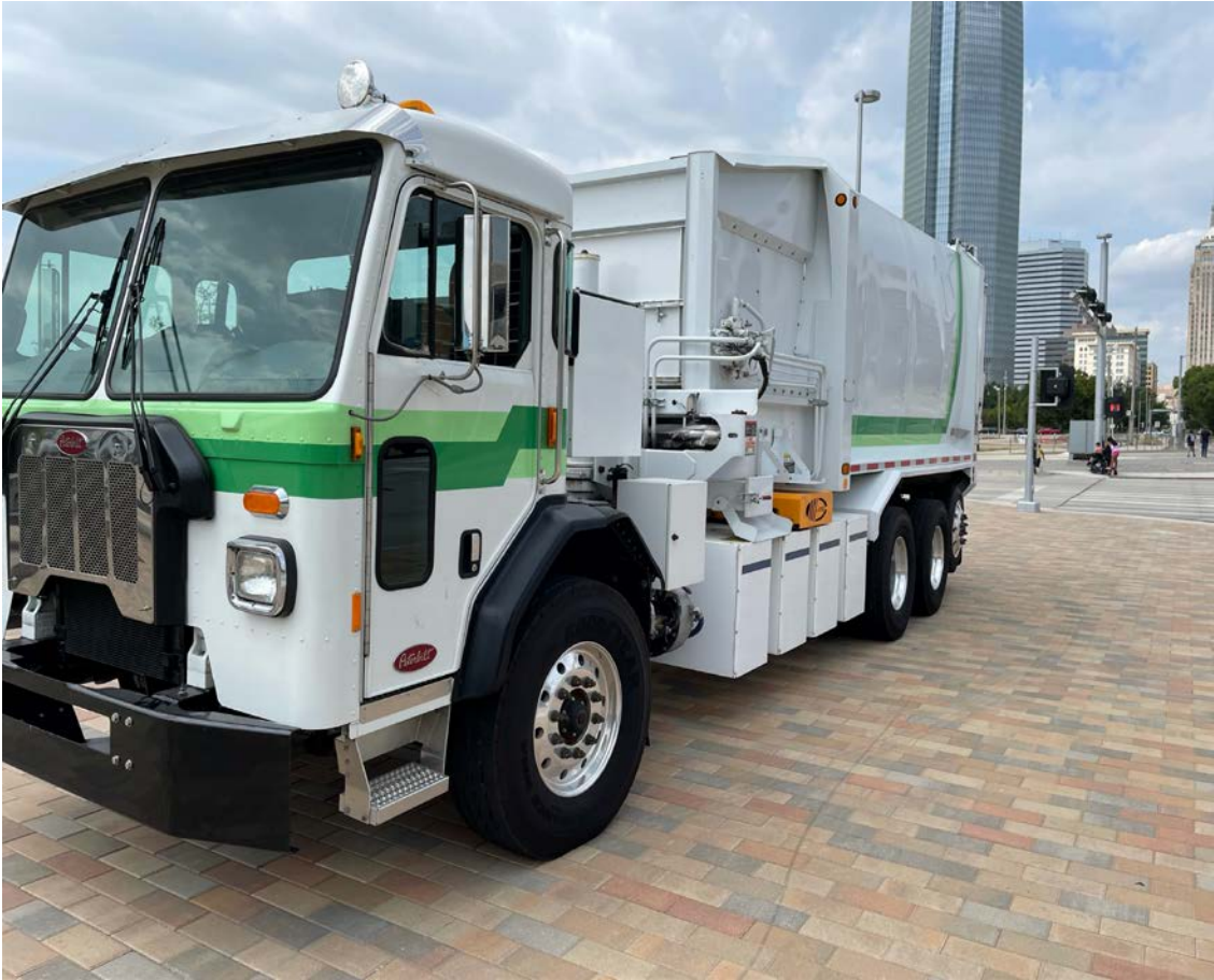
Rush Truck Centers displays a Peterbilt fully electric trash truck prototype