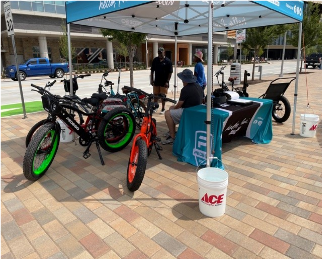
Lance King of Pedego Bikes displays ebikes