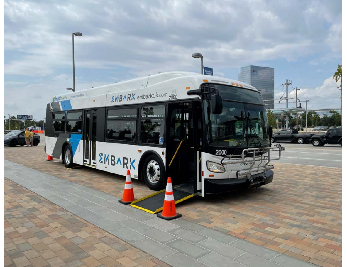
EMBARK displayed their new electric bus