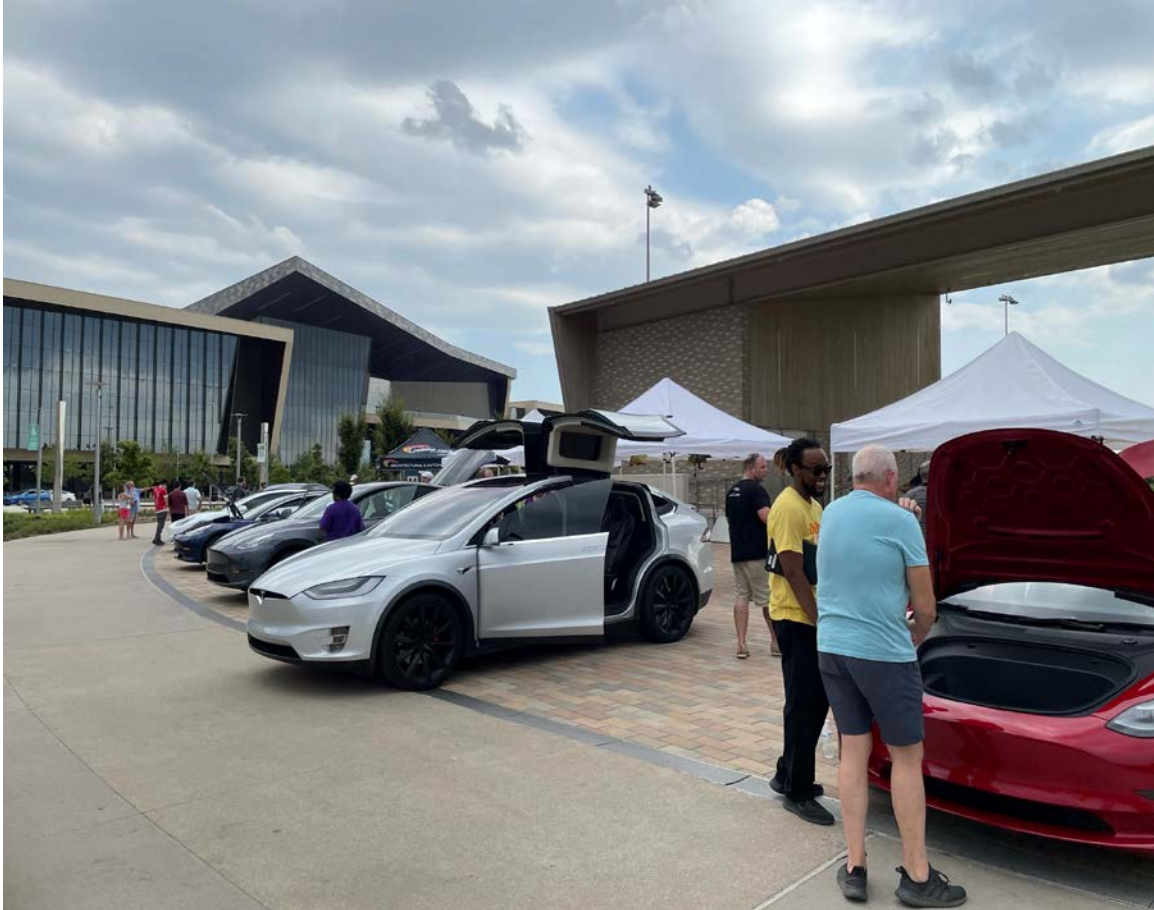
Oklahoma City's Tesla Service Center and Tesla Owners Club of Oklahoma display Teslas